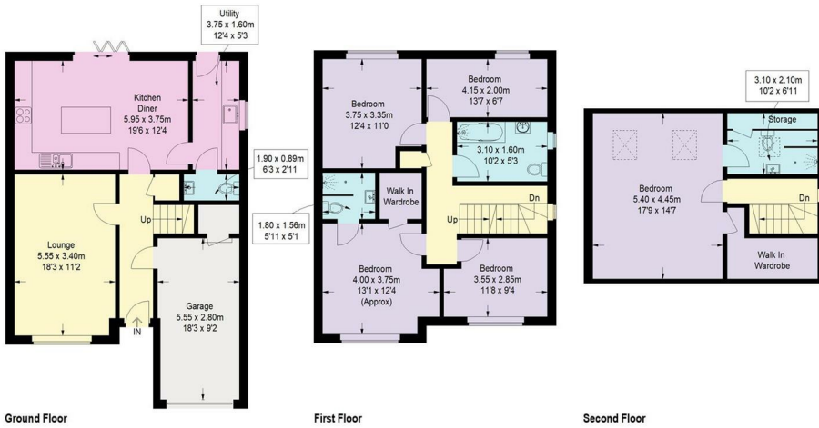
Illustration for identification purposes only, measurements are approximate, not to scale. FloorplansUsketch.com © 2023 (ID 929585)

Approximate Gross Internal Area (Including Garage) 192.4 sq m / 2071 sq ft